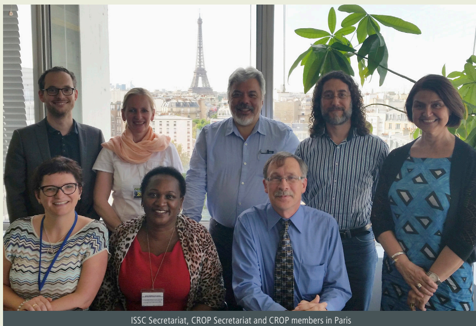
ISSC Secretariat, CROP Secretariat and CROP members in Paris

On 5 July 2017, the annual meeting of CROP’s Scientific Committee was held in the premises of the International Social Science Council (ISSC) in Paris. Some of the Scientific Committee members were able to take advantage of the fact that they were participating in the international workshop starting the following day and were able to attend the meeting in person, while others joined us online. In addition to providing input to CROP’s work plan and thematic focus, the main topics of discussion this year were the recent evaluation of CROP conducted by the University of Bergen and the potential consequences for CROP of the planned merger between the ISSC and ICSU (International Council for Science).