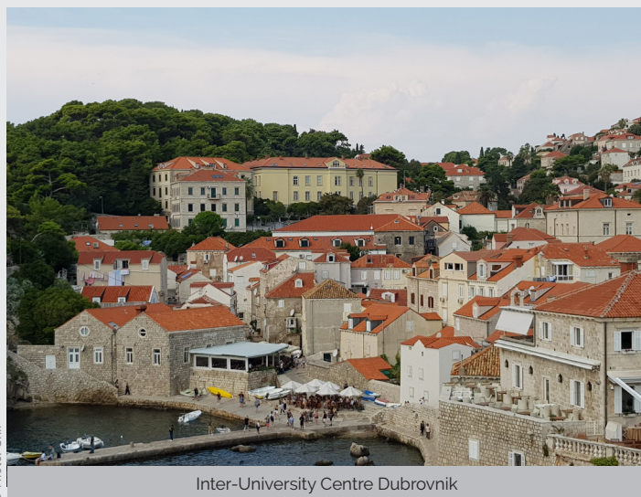
Inter-University Centre Dubrovnik

The edited volume, Social Policy, Poverty, and Inequality in Central and Eastern Europe and the Former Soviet Union , is output from an international workshop held in June 2017 in St. Petersburg.